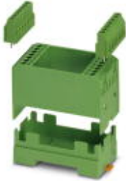
Electronic housing set, consisting of electronic housing and printed circuit termination blocks, pitch 5

Please be informed that the data shown in this PDF Document is generated from our Online Catalog. Please find the complete data in the user's documentation. Our General Terms of Use for Downloads are valid ( http://phoenixcontact.com/download )