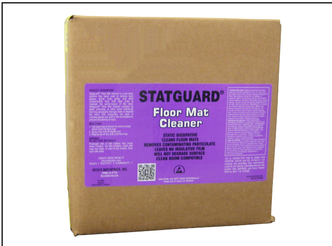
Figure 2. 2.5 Gallon Bag-in-Box ( 10444 )