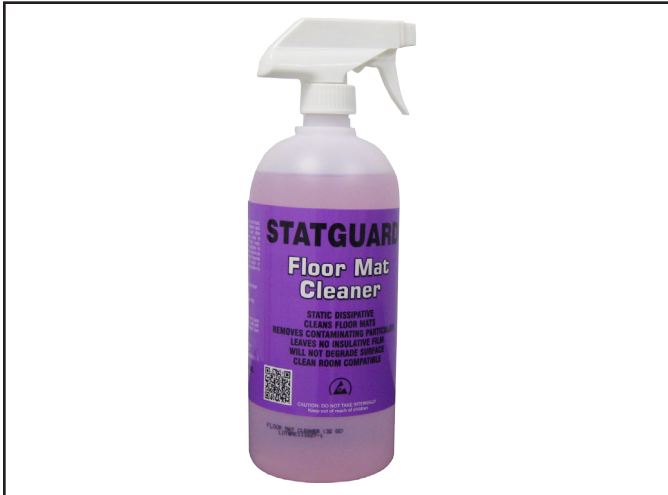
Figure 1. 1 Quart Spray Bottle ( 10443 )