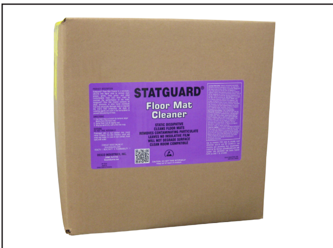
Figure 3. 5 Gallon Bag-in-Box ( 10445 )